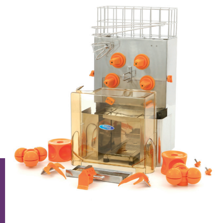
Easy to dismantle and clean