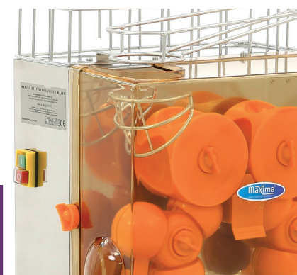
Anticorrosive press parts and on-off switch on the side