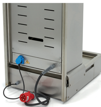
Electric cable on backside