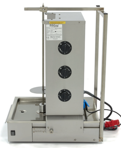
With adjustable skewer and burners for perfect preparation