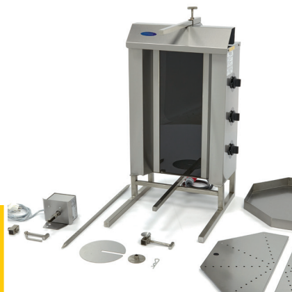
Easy to dismantle and clean