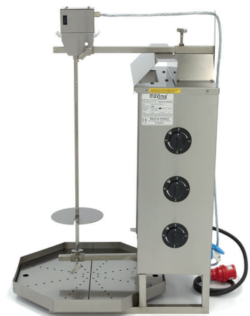
With adjustable skewer for perfect preparation.