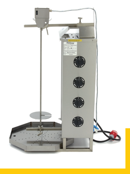
With adjustable skewer for perfect preparation.