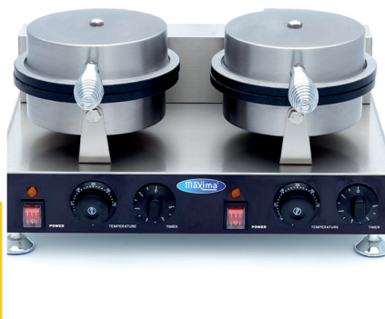
Simple and robust control switches