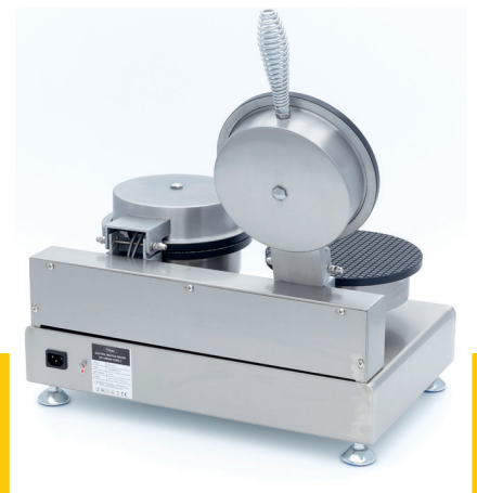
Easy to clean