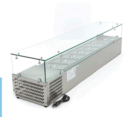
Static cooling with foamed evaporator