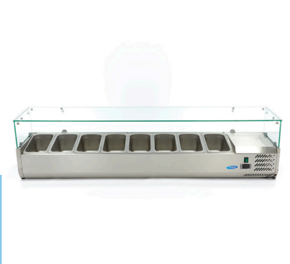
Stainless steel housing with capacity of 8 x 1/3 GN